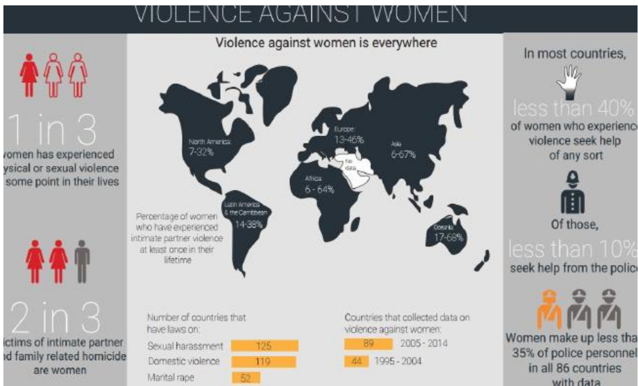
Startling findings ... the UN report highlights that violence against women is everywhere.

The level of acceptance of “wife-beating” decreases over time as public awareness rises, the report said.